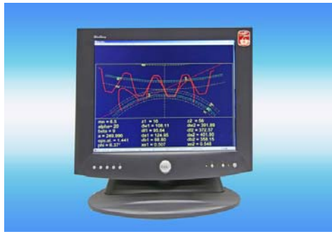
Strength- and lifespan calculation