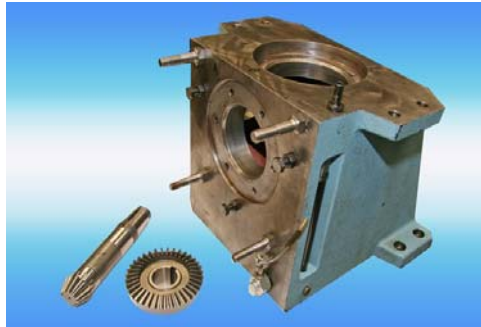
Overhauling of gearbox