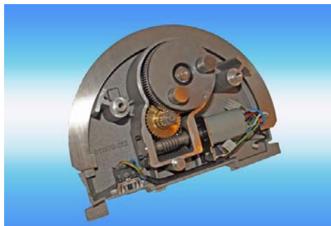
Gearbox for distribution centre