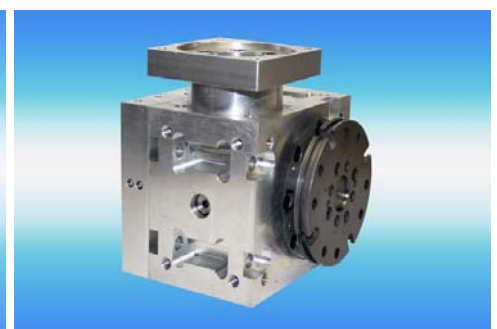
Gearbox for pick & place robot