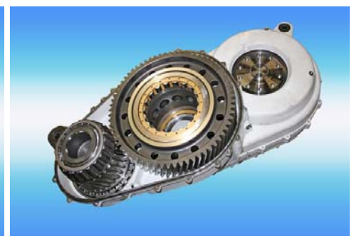
Gearbox for metro bus "Phileas"